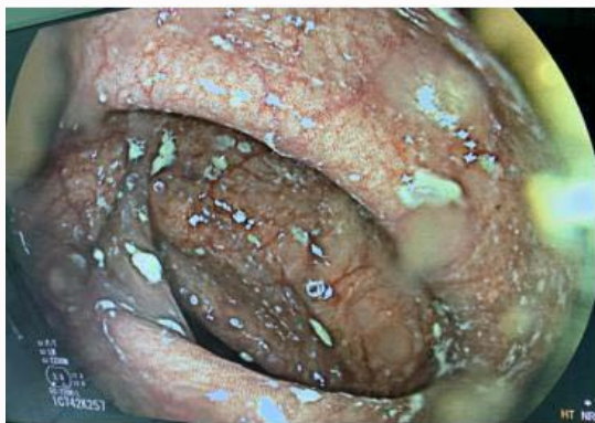
Figure 1: Dark brown appearance of colonic mucosa on colonoscopy.