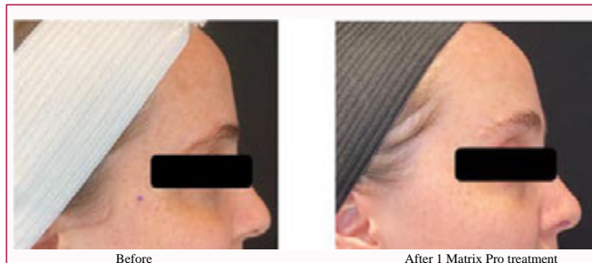
Figure 3: A 32-year-old Fitzpatrick skin type IV female presenting with irregular skin tone (pigmentation, melasma). There was visible improvement in skin tone after 1 Matrix Pro treatment to the full face (excluding jawline and submentum), using primarily single insertion to the deeper skin layer depths, with RF energy ranging from 0.5 J to 2.0 J, and a 2 nd insertion to the middle depth for nasolabial folds and perioral area with RF energy of 1.0 J. Vascular density on OCT was also reduced following treatment (P416 in Figure 2 graph).