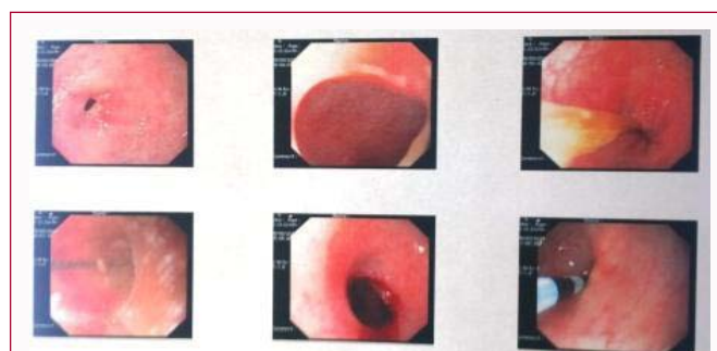
Figure 1: Endoscopic view of colonic stenosis during balloon dilatation.