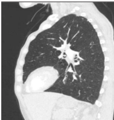
Figure 3: Sagittal CT image demonstrating a nodular opacity in the carina between the upper division and lingula bronchus.

CRP (CRP: 112.7 mg/L) were high and consistent with infection. ECG demonstrated sinus tachycardia of 104/minute. Chest X-ray (Figure 1) showed left lower lobe atelectasis. Pulmonary function tests showed mild obstructive defect with FEV_1 : 2.23L (60%), FVC: 3.14 L (64%) and FEV_1/FVC : 71%. Axial thorax CT revealed atelectasis and pneumonic consolidation with air bronchograms in the right lower lobe (Figure 2) while a nodular opacity in the left upper division and lingula bronchus carina was demonstrated in the sagittal CT image (Figure 3). Antibiotic treatment was commenced for pneumonia that showed complete resolution after ten days with leukocytosis and CRP returning to normal levels. Fiberoptic bronchoscopy revealed a left vocal nodule (Figure 4), a nodular lesion in the left upper division and lingula bronchus carina (Figure 5) and complete obstruction of the right lower lobe with submucosal tumoral infiltration (Figure 6).