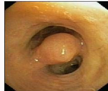
Figure 5: Bronchoscopic view of the hamartoma in the the carina between the upper division and lingula bronchus.