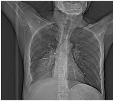
Figure 1: Chest X-ray showing atelectasis and pneumonic infiltration in the right lower lobe.