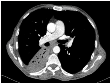
Figure 2: Axial thorax CT revealing right lower atelectasis and pneumonic infiltration.