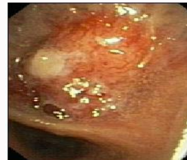
Figure 6: Submucosal tumoral infiltration leading to complete obstruction of the right lower bronchus.

cord and the left carina one nodule revealed identical histopathologic features relevant to hamartoma. Histologic sections showed variable mixture of mature hyaline cartilage, fat, smooth muscle with immature myxomatous tissue at the periphery of the cartilage and entrapped clefts lined by respiratory epithelium.