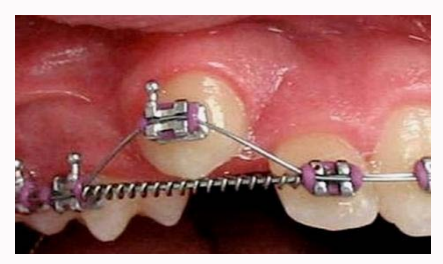
Figure 3: Case 1: Placement of orthodontic bracket and successful movement of the tooth into the arch.