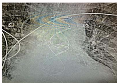
Figure 1: Radiograph of sternal cables.