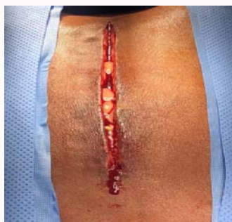
Figure 2: Sternal wound after initial incision showing purulence.