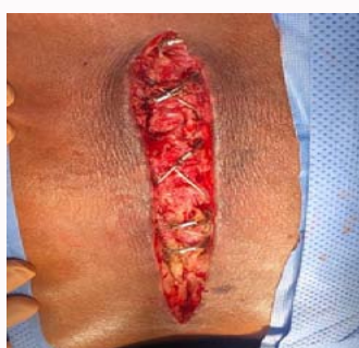
Figure 3: Sternal wound showing sternal cables.