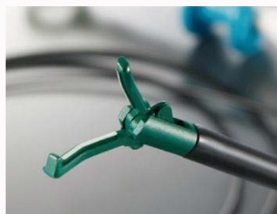
Figure 3: Distal tip of the SB (stag beetle) knife.

No procedure-related bleeding or perforation was noted.