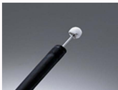
Figure 2: Distal tip of the ITknife2 (insulated-tip diathermic knife).