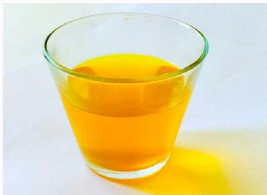
Figure 1: Tincture of Di Long and saffron in 5% sweetened alcohol.

I will only to mention their Chinese names and English names but not to describe their functions, to which readers may search through the web sites. Anyhow, the reason why I use them is that each of them has, generally to speak, at least one or more functions in nourish the liver, the kidney and to benefit the blood circulation. The preparation procedures are shown in Table 1.