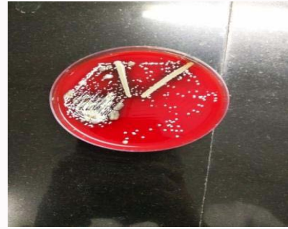
Figure 2: Further culture on sheep blood agar plate showed wrinkled dry white colonies were observed.

daily for 12 weeks with reduction in the dosage after 4 weeks along with ciprofloxacin. The patient showed good response after 1 week initiation of treatment. The patient was discharged with a combination treatment of cotrimoxazole and moxifloxacin. On further follow up of appointment, there was clinical and radiological improvement noted.