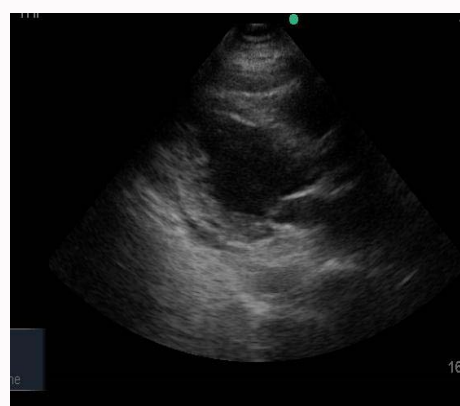
Figure 4: 2D echocardiogram showing regression of pericardial effusion.

The difference between the present case and classical PMIS after cardiac injury is early onset in the present case as early as 3 hrs as against couple of weeks in classical PMIS.