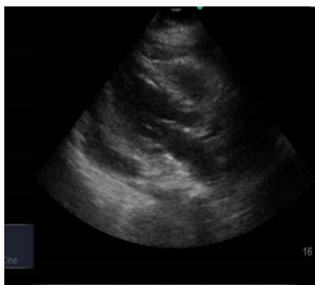
Figure 2: 2 D echocardiogram showing moderate pericardial effusion.

mesothelial pericardial cells and blood in the pericardial space [2,6]. The initial injury is thought to release cardiac antigens and stimulate an immune response. The immune complexes that are generated are then deposited in the pericardium, pleura, and lungs, eliciting an inflammatory response [6]. This theory finds support with following observations: