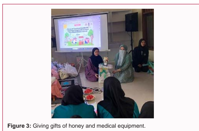
Figure 3: Giving gifts of honey and medical equipment.

Our intervention program incorporated regular physical activity,