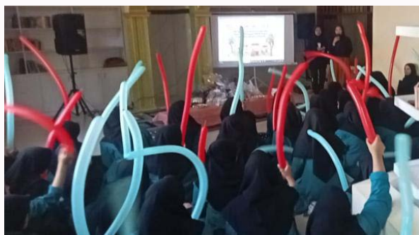
Figure 1: The students rise the balloons up for answering the pre- and post-test.

Physical activity: Students participated in aerobic for 15 min