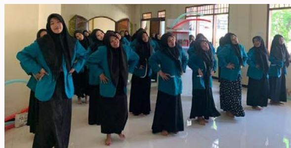
Figure 2: Physical activity by participants.

From the data in Table 2, the distribution of participants education is obtained, no school 4.87%, where 2.43% are in elementary school, 48.78% are still in junior high school, where 43.90% are in senior high school and none have a university education.