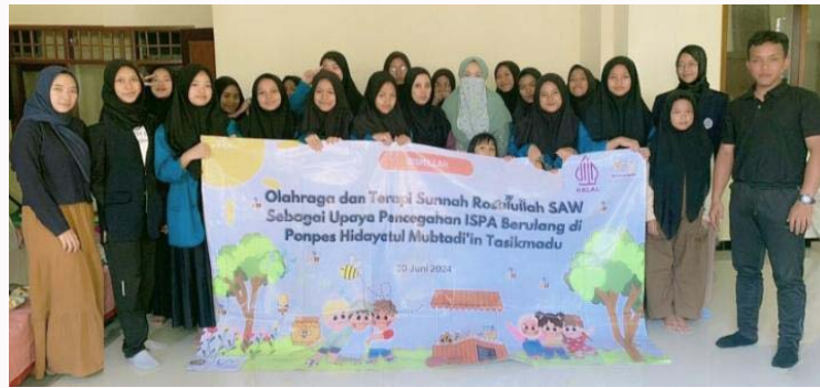
Figure 4: The documentation after the event has done.