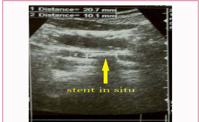
Figure 4: Case 1: Postoperative USG abdomen showing stent in situ after sphincteroplasty with stent in MPD (main pancreatic duct).