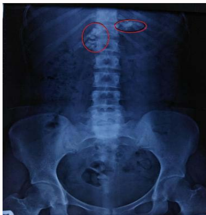
Figure 6: Case 2: X-ray Supine Abdomen Shows Calcification in T12 and L1 Vertebra S/O Pancreatic Calcification.

of the first case, also presented with recurrent abdominal pain since childhood similar to her father. She had complains of steatorrhea and occasional vomiting. She was then advised to do X-ray abdomen which revealed multiple calculi in the pancreas. Her laboratory reports were as follows: