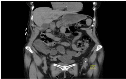
Figure 2: Small bowel loop lateral to cecum.

anastomosis was performed. Patient withstood the procedure well and had a normal postoperative course. The patient was tolerating diet on postoperative day 1 and subsequently discharged on postoperative day 2.