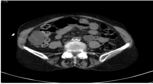
Figure 1: Dilated small bowel loop lateral to cecum in the right paracolic gutter.