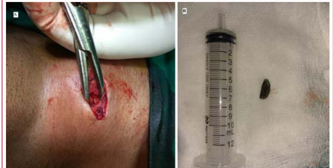
Figure 2: (A) Penetrating wound in the right ala of thyroid cartilage, (B) Metallic foreign body removed from right bronchus middle lobe medial segment opening.

In literature, there are few reports where the penetrating airway foreign body was aspirated [1-4, 6-8]. These foreign bodies include