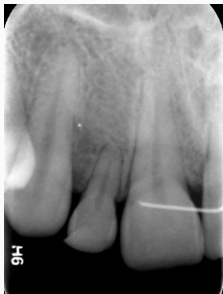
Figure 2: Pre-operative radiograph: Radiograph of maxillary left lateral incisor showing short clinical root.