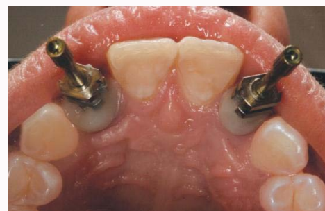
Figure 9: Implant impression: Capturing molded soft tissue profile with custom impression copings.