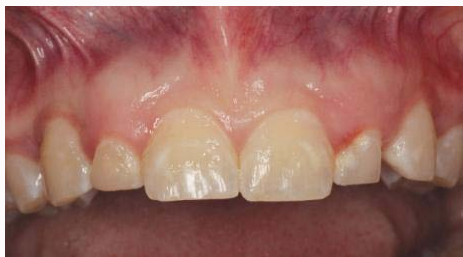
Figure 1: Pre-operative view: Malformed permanent maxillary right and left lateral incisors.