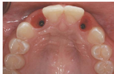
Figure 8: Mature peri-implant soft tissue: Healed peri-implant soft tissue with ideal emergence profile.