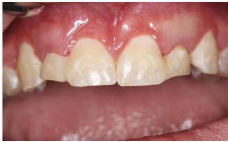
Figure 5: Bonded extraction teeth in place: Frontal view of bonded extracted lateral incisors immediately after implant placement.