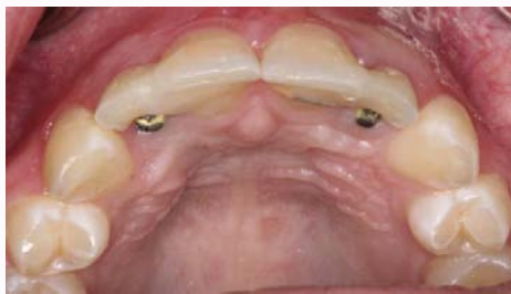
Figure 6: Bonded extraction teeth in place: Occlusal view of bonded extracted lateral incisors immediately after implant placement.

to restore the missing lateral incisors. Modifications to the patient's teeth were made. The roots of the extracted teeth were sectioned and the palatal and cingulum surfaces of the crowns were removed. The remaining intact cervicofacial facades were shaped to mimic ovate gingival contours to aid in facial soft tissue contouring (Figure 4). The distal surfaces of the left and right central incisors were then etched with 32% phosphoric acid (Unietch, Bisco Inc.) and primer and adhesive were applied (Optibond FL, Kerr.) The contoured lateral incisors were bonded to the central incisors with flowable resin (Synergy D6 Flow, Coltene) (Figure 5 and 6). The bonded extracted lateral incisors did not apply pressure to the newly placed implants or grafted sites. The bonded restorations were taken out of occlusion and the teeth remained bonded throughout the healing period without complications. This technique allowed early facial soft tissue contouring and uneventful healing of the implants and graft sites.