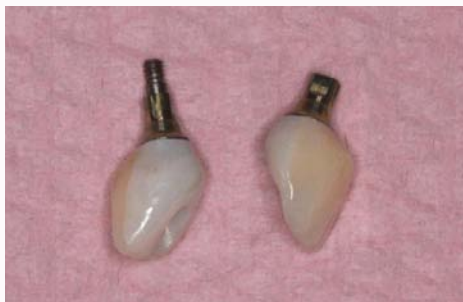
Figure 10: Definitive restorations with ideal contour and emergence profile: All-ceramic crowns were luted extra orally to the custom titanium abutment (Variobase) and the screw-retained abutment-crown unit was then placed intra orally.