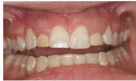
Figure 7: Screw-retained provisional restorations: 8-week post placement, screw-retained provisional restorations inserted to finalize surrounding soft tissue healing.

Eight weeks post-surgery the bonded provisional restorations and healing abutments were removed and a fixture level impression was made with open tray impression copings (NC Impression post, Straumann) and poly vinyl siloxane impression material (Aquasil Ultra LV and monophasic, Dentsply Caulk). The tray was removed after the impression was set and the healing abutments were replaced and the extracted lateral incisor interim restorations were re-bonded. The implant-level impression was poured in Type 5 dental stone (Jade Stone, Whipmix Corp) to obtain a working cast. Screw retained provisional restorations were fabricated in acrylic resin (SNAP, Parkell) using a pull down matrix of a cast of the diagnostic wax-up and temporary abutments (NC Temporary Abutment, Straumann) screwed to place in the working model. An ideal emergence profile was developed in the provisional screw-retained restorations which were placed in the patient to finalize the surrounding soft tissue healing (Figure 7). The provisional restorations were torque to 15 Ncm and the screw channels filled with cotton and Teflon tape and sealed with flowable resin. Centric and lateral occlusal contacts were eliminated to minimize non-axial loading. Oral hygiene instructions