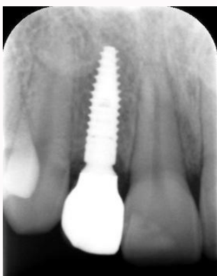
Figure 11: Post –operative radiograph: Radiograph of definitive restoration of maxillary left lateral incisor taken on the day of insertion.