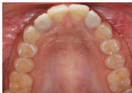
Figure 14: Follow up occlusal view: Six-month follow-up occlusal view of definitive restorations in place.