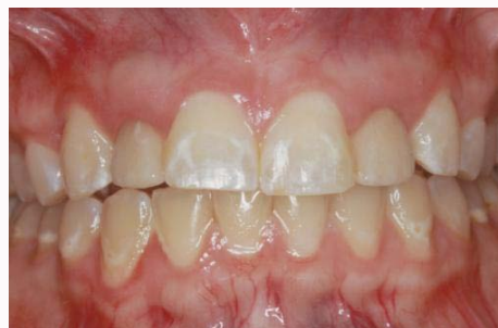
Figure 13: Follow up frontal view: Six-month follow up frontal view with definitive restorations in place.

working cast. Custom titanium abutments (NC Variobase abutment, Straumann) and all-ceramic crowns (Lava, 3M ESPE) were fabricated. The crowns were luted to the custom titanium abutments extra orally (Figure 10). The screw-retained abutment- crown assembly was then tried in intra-orally. Radiographs were taken to confirm the seating (Figure 9 and 10) and occlusion was checked with articulating paper (Articulating paper, Henry Schein) and shim stock (Shimstock, Bausch). The definitive restorations (Figure 11 and 12) were torque according to the manufacturer's instruction and the screw channels were filled with Teflon tape and composite resin (Z250, 3M ESPE). Oral hygiene instructions were given and the patient was placed on a 3-month recall.