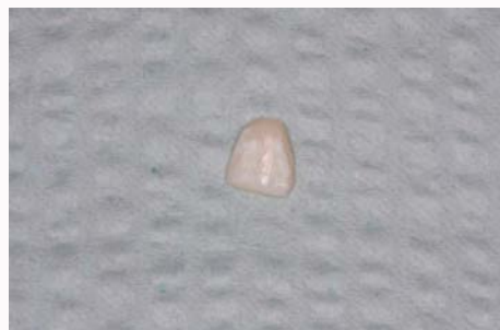
Figure 4: Shaped extracted lateral incisor: The root of the extracted lateral incisor was sectioned and the palatal surface of the crown was trimmed. The remaining intact cervicofacial facade was shaped to mimic an ovate gingival contour to aid in soft tissue contouring.

On the day of the surgery, extraction of the malformed maxillary lateral incisors was performed and two endosseous implants (3.3 × 12 mm NC SL Active, Straumann USA) were placed using the surgical guide. The implants were torque to 35Ncm and healing abutments were placed (NC Healing abutment, 3.6 × 3.5 mm Straumann USA). Concurrent allogeneous bone grafting was performed to achieve adequate ridge anatomy and bone thickness. Post-surgery, the patient's extracted teeth were used to fabricate bonded restorations