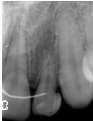
Figure 3: Pre-operative radiograph: Radiograph of maxillary right lateral incisor showing short clinical root.

A number of published articles have shown that survival rates with IIPR are comparable to those achieved with traditional protocols [16,18-20]. However, Atieh et al. [21] determined that IIPR with IIP increases the risk for implant failure. Lateral forces and small diameter implants further negatively affect implant survival of immediately loaded implants [22]. Khzam et al. [23] suggested the possibility of unpredictable soft and hard tissue healing with IIPR. Some authors have suggested that in order to maximize the chance of success, IIPR should be performed along with IIP only when primary stability can be achieved [7,8]. Also, IIPR should not contact the opposing dentition in centric and eccentric occlusion [1,18,24]. When bone grafting is performed concurrently with IIP, IIPR is not indicated due to the risk of implant failure [21]. Instead, a two-stage protocol is to be followed