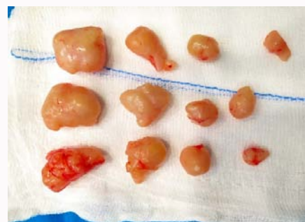
Figure 3: Macroscopic view of the lesions. Round/ovoid tumor pieces with a brownish-white nodular surface with a maximum diameter of 0.5 cm to 2.5 cm. On sectioning, the masses were solid and encapsulated and consisted of yellowish tissue of uniform appearance.

Several articles describe the presence of isolated schwannomas in the posterior tibial nerve [1,4,7,8,13-15]. However, there are few publications showing multiple schwannomatosis located in this nerve and, in no case, with a number of lesions as high as that seen in our patient. Only von Deimling et al. [16] described a similar