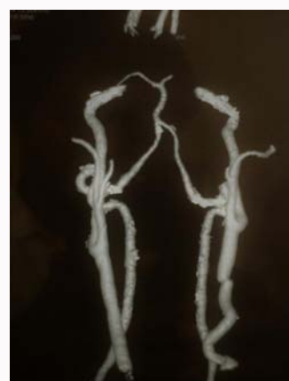
Figure 4: CT angiogram showing Patent.

Vascular trauma to the neck is classified into two major categories, namely blunt or penetrating, according to the mechanism of vascular injury [4]. Penetrating vascular trauma of the neck is observed mainly in males, and in 70% to 90% of all carotid injuries the damage is located in the common carotid artery [5].