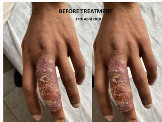
Figure 3: Lesion of the lupoid CL before treatment.