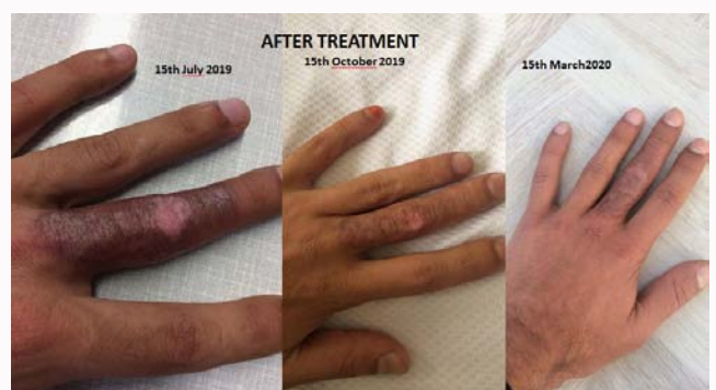
Figure 4: Lupoid CL, after treatment of the lesion with intra lesion almeoglumine antimoniate (Glucantime®).

patient was called monthly for control the healing of the lesion for one year, it was seen that the lesion was regressed (Figure 4).