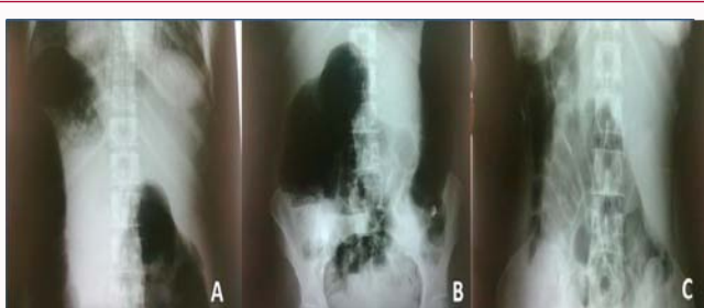
Figure 3: Multiple plain abdomen X-ray showing (A): marked abdominal distension (Day 2); (B): massive abdominal distension and multiple fluid levels (paralytic ileus) (Day 3) and (C): normal plain abdomen X-ray (Day 5).

By the 4 th day of admission, the patient condition improved, but the bilateral alveolar shadows persisted. After conservative treatment, the patient passed feces and the intestinal sounds returned but still diminished.