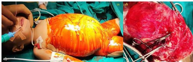
Figure 1: A) The child with the lump. B) The encapsulated mass.