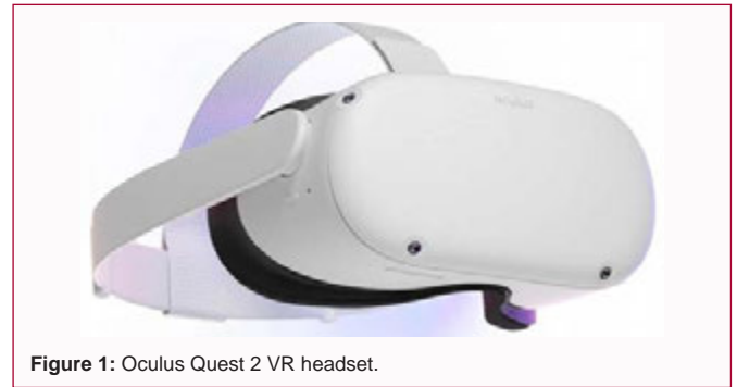
Figure 1: Oculus Quest 2 VR headset.

Patients in the VR group were given an American-made Oculus Quest 2 VR headset (Figure 1) that displayed a pre-selected cartoon (The Boss Baby). The images were three-dimensional and continuously adjusted to the child's head movements to give them