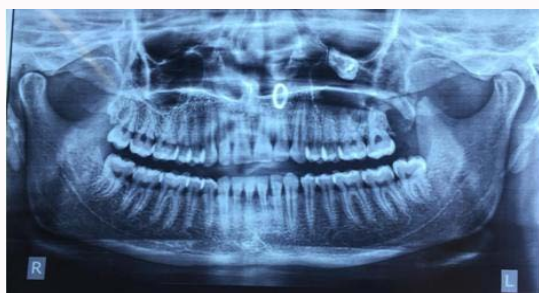
Figure 1: OPG revealed unerupted third molar in the right maxillary sinus below the Infra orbital region with cloudy appearance of right maxillary sinus.