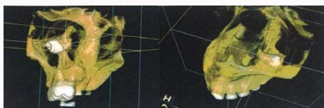
Figure 2A: The apical end of root of unerupted tooth seems to be impinging on wall of left nasal bone and medial border of left maxillary sinus.