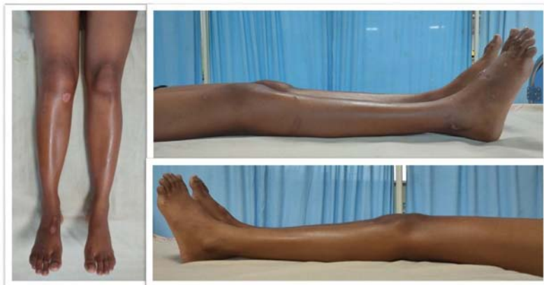
Figure 1: Preoperative clinical image showing diffuse swelling on right knee, with healed abrasions measuring 6 cm, without any obvious valgus/varus or flexion deformity.