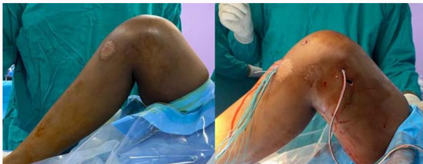
Figure 7: Intraoperative image showing posterior sag sign present which improved clinically after the final construct.