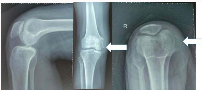
Figure 2: Preoperative plain radiograph of the right knee; Lateral, Antero-posterior and Skyline view showing comminuted avulsion fracture of the medial condyle of the femur (arrow).