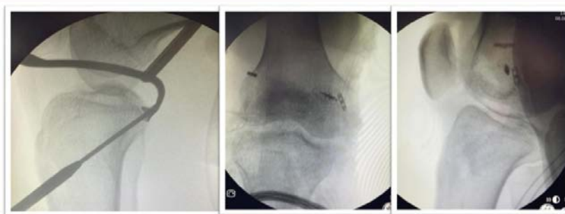
Figure 6: Intra-operative fluoroscopy image showing placement of zig for PCL reconstruction and a final construct where the EndoButton of ACL and PCL with the Suture Anchor of MCL in place.

hyperintensity with a complete tear of Posterior Cruciate Ligament (PCL) on its mid-substance with empty notch sign, also the evidence of avulsion of the Medial Collateral Ligament (MCL) was present, however, both the menisci were normal (Figure 4). Then the final diagnosis of Multi-ligamentous injury (ACL + PCL + MCL) right knee was made.