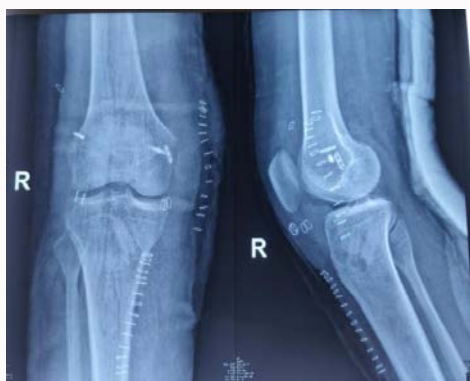
Figure 8: Postoperative radiograph showing EndoButton of ACL and PCL with a suture anchor of MCL seen in place.

knee brace, converted to a hinged knee range of motion brace on two weeks follow-up. Closed chain Knee range of motion exercise and toe touch bearing mobilization was started two weeks postoperative, and full weight bearing mobilization was started six weeks postoperative. Back to normal activity was initiated three months after the postoperative phase. On follow-up of a patient for one year, the patient did not develop any local or systemic complication, a Lysholm score of knees was 88, and a Tegner Activity Score was 7.