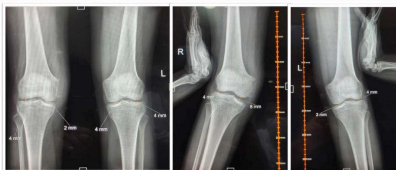
Figure 3: Preoperative stress view radiograph, showing significant medial end opening of 8 mm on lateral stress view.

Non-alcoholic. No significant past medical and surgical history. No any drug or any known allergic history. No history of any known comorbidities. No significant family history.