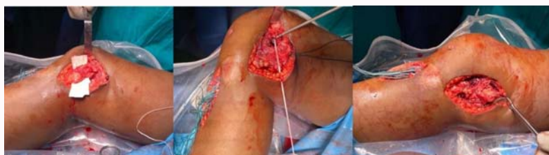
Figure 5: Intraoperative image showing open MCL repair using an anchor suture.