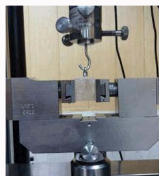
Figure 1: Universal testing machine was used for measuring the uniaxial tensile bond strength of the samples.

Schann, Liechtenstein). The castings were evaluated, evident nodules were eliminated by a carbide bur (H71EF, Brasseler, Germany), and internal surfaces of the frames were air-abraded by 50-microns aluminum oxide particles (Basic master; Renfert GmbH, Hilzingen, Germany). Fit checker spray (Occlude, Aerosol indicator spray, Pascal Inc, Seattle, Washington) and no.2 round bur (Teezkavan, Tehran, Iran) were used to adjust the frameworks for complete passive sitting on the abutments. The quantity of adjustment times was recorded, and results were compared using Mann-Whitney test. Frameworks were cemented on abutment analogues using zinc phosphate cement (Hoffmann, GmbH, Berlin, Germany) by applying finger pressure for 10 minutes. Cemented samples were placed in an incubator in 37 degrees centigrade for 24 hours, and thermocycled for 5000 cycles at 5 \pm 1^\circ\text{C} and 55 \pm 1^\circ\text{C} with a dwell time of 30 seconds and transfer time of 10 seconds. This program was equivalent to 6 months' clinical application. The frames' retention was measured by the UTM (with 500-kg load and crosshead speed of 0.5 mm/min) (Figure 1). The results were analyzed using independent sample T test.