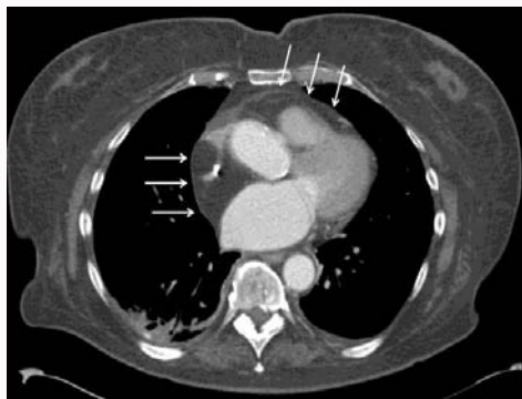
Figure A: Contrast enhanced axial CT image demonstrates fat density tissue (-90 Hounsfield units) arising from the interatrial septum which circumferentially narrows the lower SVC and proximal right atrium. Fat density tissue extends to the lateral right atrial wall and anteriorly along the right ventricular outflow tract (arrows). Post-processing revealed the cavoatrial lumen to measure 0.65 cm 2 area (normal 6.79- 10.02 cm 2 )(8) with the catheter tip occupying approximately 0.23 cm 2 .