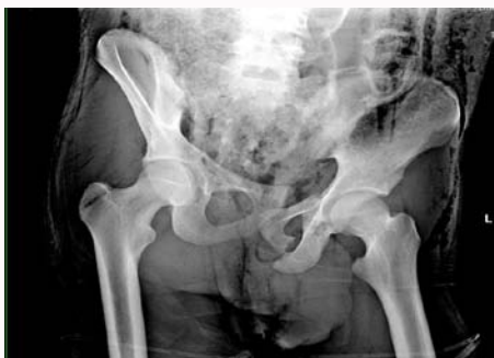
Figure 2: Anteroposterior pelvic X-ray of the patient at presentation.