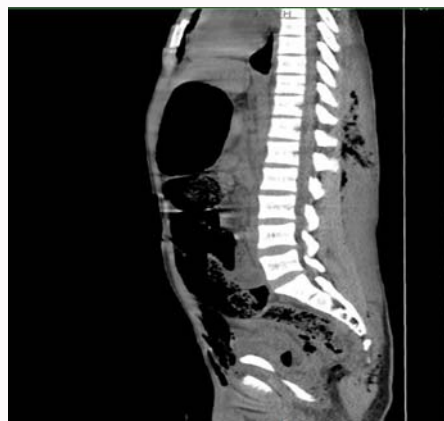
Figure 4: Non contrast CT with Sagittal reconstruction thoraco-lumbar compression fracture.