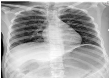
Figure 1: Supine Chest X-ray of the patient at presentation.