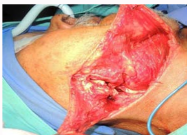
Figure 2: Wound flap expose.