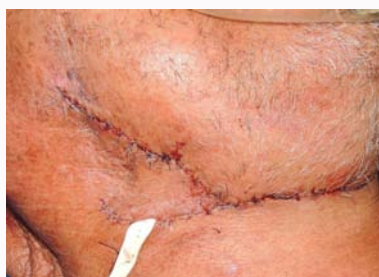
Figure 6: Wound closed.