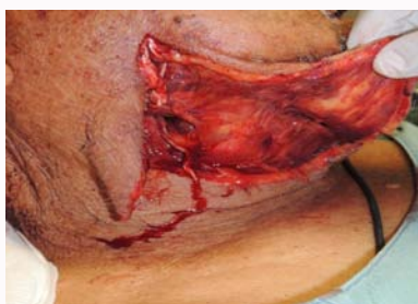
Figure 1: ER wound checking.