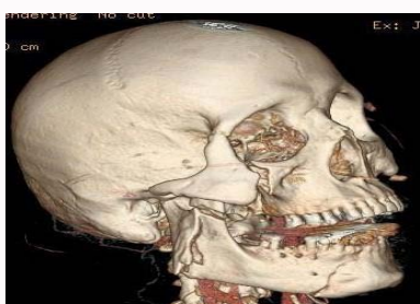
Figure 3: CT scan 3-D reconstruction.