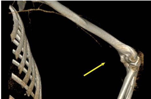
Figure 2: 3D reconstructed CTA of an unopacified, unvisualized, segment of the left brachial artery concerning for transection versus thrombosis.

were strong and equal bilaterally, and she was normotensive.