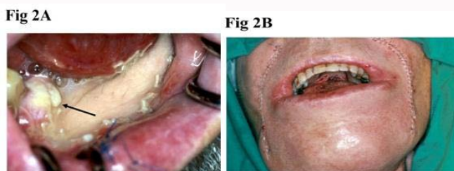
Figure 2: Bilateral nasolabial regional flaps in edentulous patients achieve this functional repair but cause cosmetic damage at the donor sites.