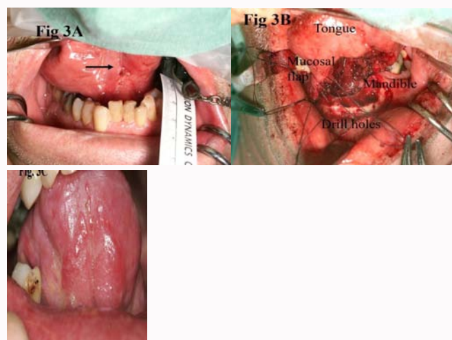
Figure 3: The mucosal flaps were elevated from the lateral aspect of the floor of mouth and tongue.

Good functional reconstruction of the floor of mouth demands time and challenges one's technical expertise. Bilateral nasolabial regional flaps in edentulous patients achieve this functional repair but cause cosmetic damage at the donor sites (Figure 2). Many institutions use free micro vascular radial forearm flaps. However, this technique requires increased resources and time, produces