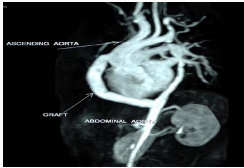
Figure 3: Postoperative magnetic resonance angiogram showing the bypass graft between ascending aorta and proximal abdominal aorta with wide unrestricted proximal and distal anastomoses with no kinking, distortion, flattening of the bypass graft.

[1-7]. Liberthson and colleagues noted that 10.3% (24/234) patients with coarctation of aorta presents after the age of 40. 7 The rates of recurrent coarctation of aorta repaired in early infancy ranged from 5% to 10% [20,21]. Recurrent coarctation is still a controversial subject, beginning with the proper definition to the best strategy of management. Published literature defines recurrent coarctation of the aorta using different criterions. Some require a blood pressure gradient of more than 20 to 30 mmHg with an imaging modality showing at least 50% narrowing in the descending aorta [1,2]. In the current study, patients who underwent reoperation for recurrent coarctation of aorta had preoperative cross-sectional imaging confirming the recurrence.