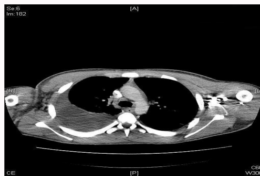
Figure 3: CTPA- Bilateral pleural effusion and cavitating nodules.

Over the next two days, the patient's pulmonary function continued to deteriorate, with decreased air entry and stony dull percussion notes at the bases of the thoracic cavity. An urgent CT pulmonary angiogram (Figure 3) demonstrated multiple bilateral cavitating nodules in the lungs suggestive of septic emboli from the thrombosed IJV, right lower lobe consolidation with compression atelectasis, bilateral pleural effusions, and hepatosplenomegaly. A repeat CT neck revealed recollection of the parapharyngeal abscess. The CRP and WCC also increased to 297 mg/l and 15.3 \times 10^9/l respectively. A drain was therefore re-sited and minimal pus was evacuated. On the advice of the microbiologist, iv Tazocin 4.5 g tds was added to Clindamycin and Metronidazole. Gentamicin and broad spectrum antibiotics were stopped and a chest drain was