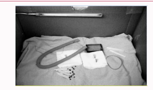
Figure 3: The view of the position of rod shaped halogen light source in the box trainer.

Laparoscopic surgery has become a standard of surgery for due to its minimally invasive nature and unique advantages over laparotomy