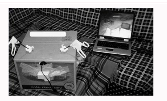
Figure 1: The view of the cardboard package to resemble abdominal cavity by creating four holes; one for web camera, one for light source, two for operating channels.