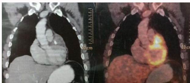
Figure 2: PET images showing high uptake around stent in proximal LAD with infective lesion.