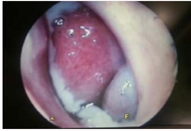
Figure 1: Endoscopic view of the giant concha bullosa presenting as a unilateral nasal mass.