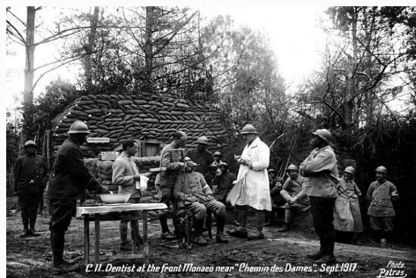
Figure 3: A dentist on the front line, near the “Chemin des Dames”- September 1917, © BNF, 2007.

published in the Official Journal on March 3 rd , Poincaré created an army dental surgeon corps throughout the war. On February 27 th , Godart specified that they would be 1 000, as warrant officers. Their clothing was similar to that of the adjutant nurses with a silver caduceus. On it was a letter D of 1cm high (Figure 2). They were affiliated to the Ministries of the Armed Forces and Interior and supervised by the chief physician of their unit. They wore the armband, as intended by the Convention of Geneva signed by the French on September 22 nd 1864 (Riaud, 2008). In January of the same year, Blatter, the president of the National dental federation (FDN in French), and Villain, its secretary, met Admiral Lacaze, the Minister of the Navy, to create an army dental corps within the Navy. On March 1 st , Lacaze sent a report to the President of the Republic asking him the creation of a “naval dental surgeon” (Konieczny, 1992). Poincaré immediately agreed. Naval dentists were integrated to the medical assistants with the same clothing and badges. As soon as the decrees were issued, the National dental federation promptly sent the texts to the French dental surgeons in a letter dated March 3 rd . On March 4 th , the Official Journal issued a decree which pointed out that the Minister of the Navy, Admiral Lacaze, was allowed to recruit dental surgeons to assist the Navy physicians who supervised them.