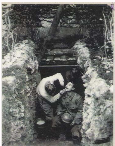
Figure 2: A dentist operating on the threshold of a care unit, © MSSA, 2006.

published in the Official Journal on March 3 rd , Poincaré created an army dental surgeon corps throughout the war. On February 27 th , Godart specified that they would be 1 000, as warrant officers. Their clothing was similar to that of the adjutant nurses with a silver caduceus. On it was a letter D of 1cm high (Figure 2). They were affiliated to the Ministries of the Armed Forces and Interior and supervised by the chief physician of their unit. They wore the armband, as intended by the Convention of Geneva signed by the French on September 22 nd 1864 (Riaud, 2008). In January of the same year, Blatter, the president of the National dental federation (FDN in French), and Villain, its secretary, met Admiral Lacaze, the Minister of the Navy, to create an army dental corps within the Navy. On March 1 st , Lacaze sent a report to the President of the Republic asking him the creation of a “naval dental surgeon” (Konieczny, 1992). Poincaré immediately agreed. Naval dentists were integrated to the medical assistants with the same clothing and badges. As soon as the decrees were issued, the National dental federation promptly sent the texts to the French dental surgeons in a letter dated March 3 rd . On March 4 th , the Official Journal issued a decree which pointed out that the Minister of the Navy, Admiral Lacaze, was allowed to recruit dental surgeons to assist the Navy physicians who supervised them.