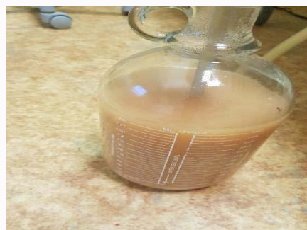
Figure 1: Pleural effusion in right lung.

This is an open access article distributed under the Creative Commons Attribution License, which permits unrestricted use, distribution, and reproduction in any medium, provided the original work is properly cited.