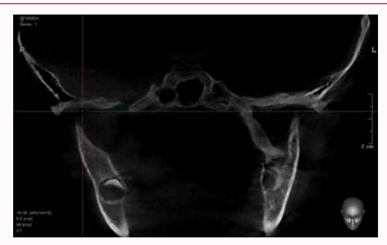
Figure 3: Coronal view of CT showing calcification extend through the whole body of left sphenomandibular ligament.

A diagnostic radiograph of three-dimensional Computed Tomography (CT) scan (Figure 2, 3) was initially reported to show linear radio-opaque within the left sphenomandibular ligament. General anesthesia accomplished using blind nasal intubation (Figure 4). A left triangular mucosal incision at molar area was planned through an intraoral approach. Elevation of mucoperiosteal flap using molt #9 periosteal elevator and detection of calcified ligament. By using osteotome and mallet, the calcified ligament dissected at the lingula. Immediately, the mouth opened with help of mouth gag (Figure 5). Dissected ossified ligament is shown in Figure 6. Flap closed by using 3.0 Vicryl interrupted sutures.