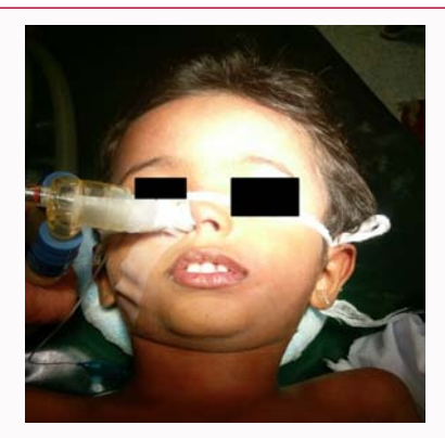
Figure 4: General anesthesia accomplished using blind nasal intubation through.