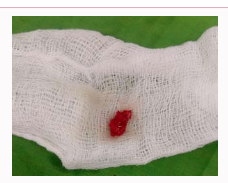
Figure 6: The excised part of calcified ligament.

causes include various syndromes and diseases, while acquired causes can be due to infection, iatrogenic, trauma, or oral care [10]. Trismus can present a challenge for intubation and have serious implications for feeding and breathing, particularly in newborns.