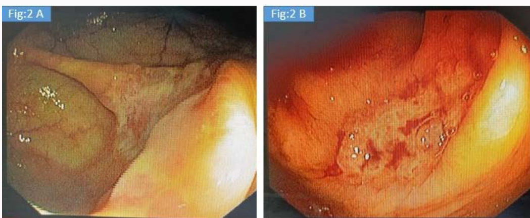
Figure 2: Colonoscopy Images of the cecum (Figure 2A) and ascending colon (Figure 2B) on flexible colonoscopy examination showing ulcerations.