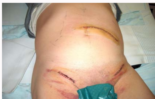
Figure 3: Wounds.

cm to 15 cm cutaneous incision that was parallel to the chondro-costal edge and spread from the linea alba to the edge of the rectus muscle. The cutaneous incision crossed the linea alba about halfway between the xiphoid and the umbilicus depending on the extension of the aortoiliac aneurismal disease. The incision of the rectus muscle allowed access to the peritoneal cavity. The oblique and transverse muscles were divided. The bowel was kept inside the abdominal cavity and displaced to the right in all cases. We usually don't use self-retaining retractors in order to avoid wall strain and to minimize postoperative pain. The abdominal wall and the bowel were retracted gently with moistened towels held by the blade intestinal retractors [9]. At the end of surgery, the patients were transferred directly to the surgical ward where the accelerated rehabilitation protocol started on the same day of surgery with early feeding and early ambulation (Figure 2). All patients underwent blended anesthesia, which included general and thoracic epidural anesthesia/analgesia [3]. We stored the patient's data in a computerized database. We always provided a clinical evaluation and an abdominal ultrasound at 6-12-18-24 months after surgery. We followed-up with the patient