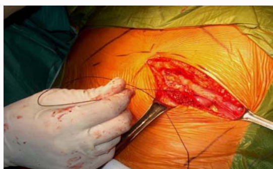
Figure 2: Closing.