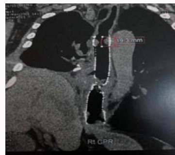
Figure 2: CT scan (coronal slice) showing an embedding of the two ends of the stents in the oesophageal wall with median fracture of the stent.

This is an open access article distributed under the Creative Commons Attribution License, which permits unrestricted use, distribution, and reproduction in any medium, provided the original work is properly cited.