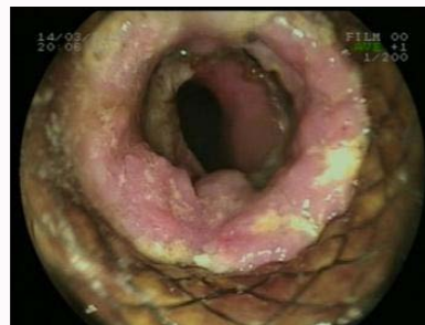
Figure 1: Upper endoscopy showing and embedding of the upper metallic stent end in the oesophageal wall.

A 70-year-old hypertensive patient underwent right bilobectomy for pulmonary carcinosarcoma. Five days after the procedure, he presented esophageal fistula treated endoscopically by a 12 cm partially covered metal stent. The patient was lost of view during three months after procedure. He presented then for dysphagia. Upper endoscopy (Figure 1) and CT scan (Figure 2 and 3) showed an impacted and fractured stent. The stent could not be removed endoscopically due to the embedding of the uncovered stent ends in the oesophageal wall.