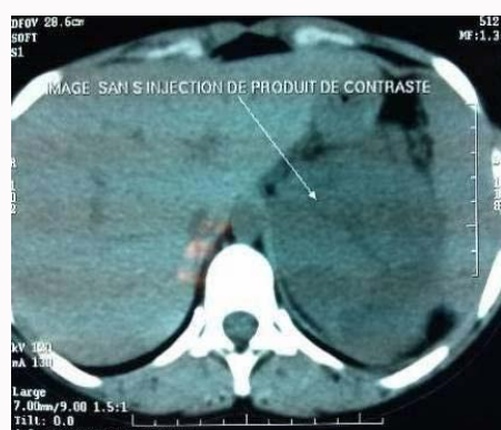
Figure 2: CT scans showed a large retroperitoneal mass of the left iliac fossa infiltrating the spine and psoas muscle.

Because of their size and intra-abdominal location, retroperitoneal synovial sarcoma can be confused with other fusiform cell neoplasms such as fibrosarcomas in adults, fibrous solitary tumors [7], PNET (peripheral neuro-ectodermic tumor), leiomyosarcoma, sarcomatous mesothelioma and GIST (Gastro-intestinal stromal tumor) [8,9]. Monobloc Surgery with negative resection margins of at least 1 cm without compromising the quality of life will be the goal. This surgery can only be validated if the feasibility has been well defined by carrying out the appropriate assessments in a pluridisciplinary consultation meeting. If not, the procedure should be limited to a diagnostic biopsy, neoadjuvant radiotherapy or chemotherapy may be indicated in order to improve the chances to R0 resection. Radiotherapy could be indicated in neoadjuvant situation in order to increase resectability chances, or as exclusive treatment when the tumor is evaluated to be irresectable or if surgery is too risky in a multi morbid patient, or as adjuvant treatment after incomplete resection, a high grade tumor or a tumor size greater than 5 cm, or as palliative radiation therapy.