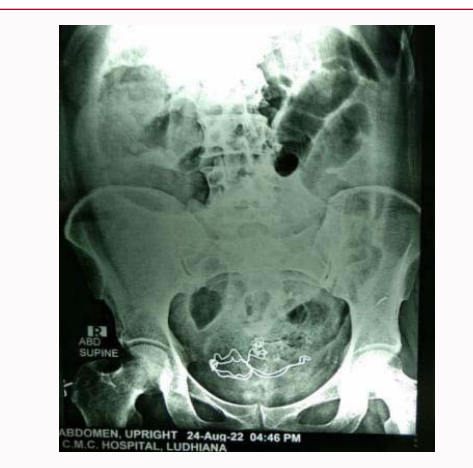
Figure 1: Plain abdominal radiograph showing radio-opaque marker.