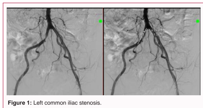
Figure 1: Left common iliac stenosis.