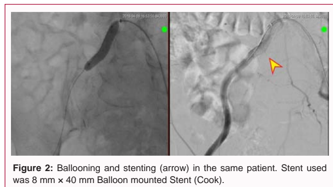
Figure 2: Ballooning and stenting (arrow) in the same patient. Stent used was 8 mm x 40 mm Balloon mounted Stent (Cook).

or duplex ultrasound) and were treated with debridement/minor amputation with regular dressing of the wound.